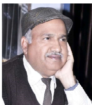
By: Vijay GarG

Today, a mix of traditional offline methods and new online tools forms the key for success. With constant evolution, we need to adapt at a relentless pace where coherent changes in the learning ecosystem with a futuristic approach are needed. Classroom continuity is permanently embedded in the current teaching methods and by quickly adapting to the changing scenarios, we can accelerate the transformation of making learning centres more student centric. The way forward in the new normal has now become clear and is helping stakeholders shape the current education landscape. Different elements of the new age education system include the following: